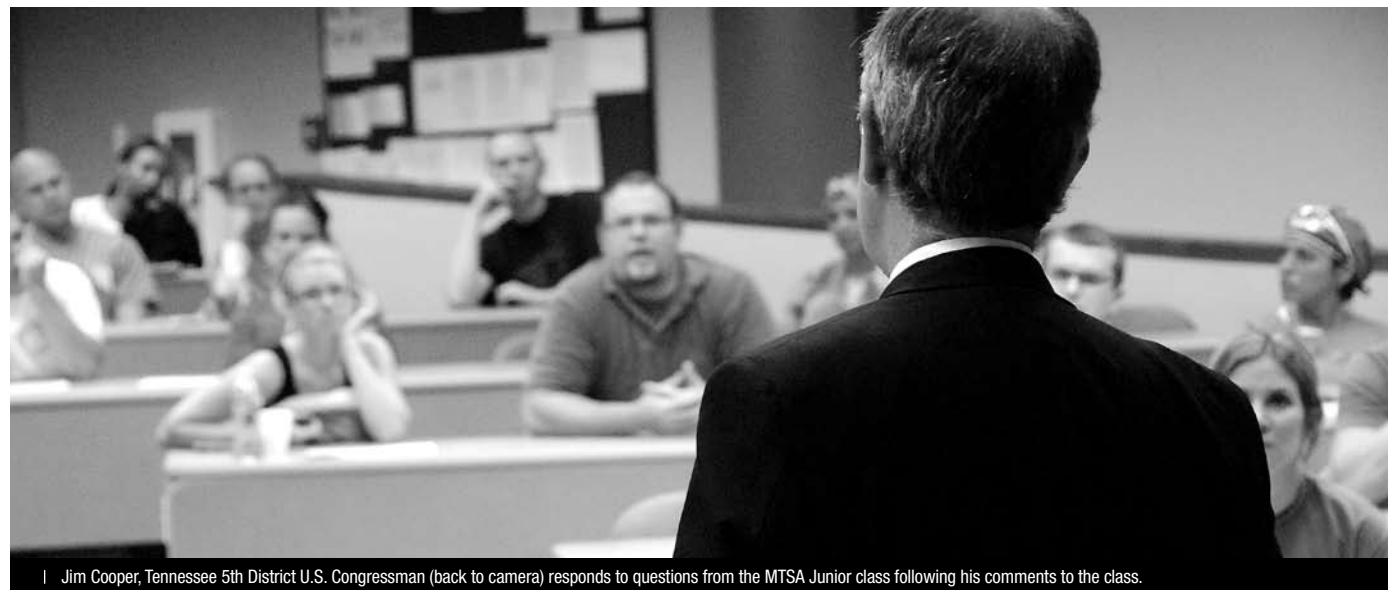
Jim Cooper, Tennessee 5th District U.S. Congressman (back to camera) responds to questions from the MTSA Junior class following his comments to the class.